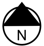
Reference Drawing - Not to Scale